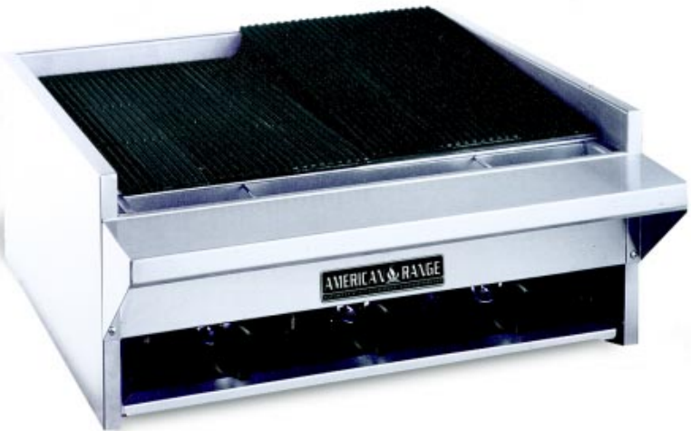
SHOWN WITH OPTIONAL STAINLESS STEEL LANDING LEDGE

All our quality counter appliances come standard with a stainless steel exterior and the best warranty in the business. Look to American Range for innovation, reliable performance, quality and attention to your equipment needs and delivery, now and in the future.