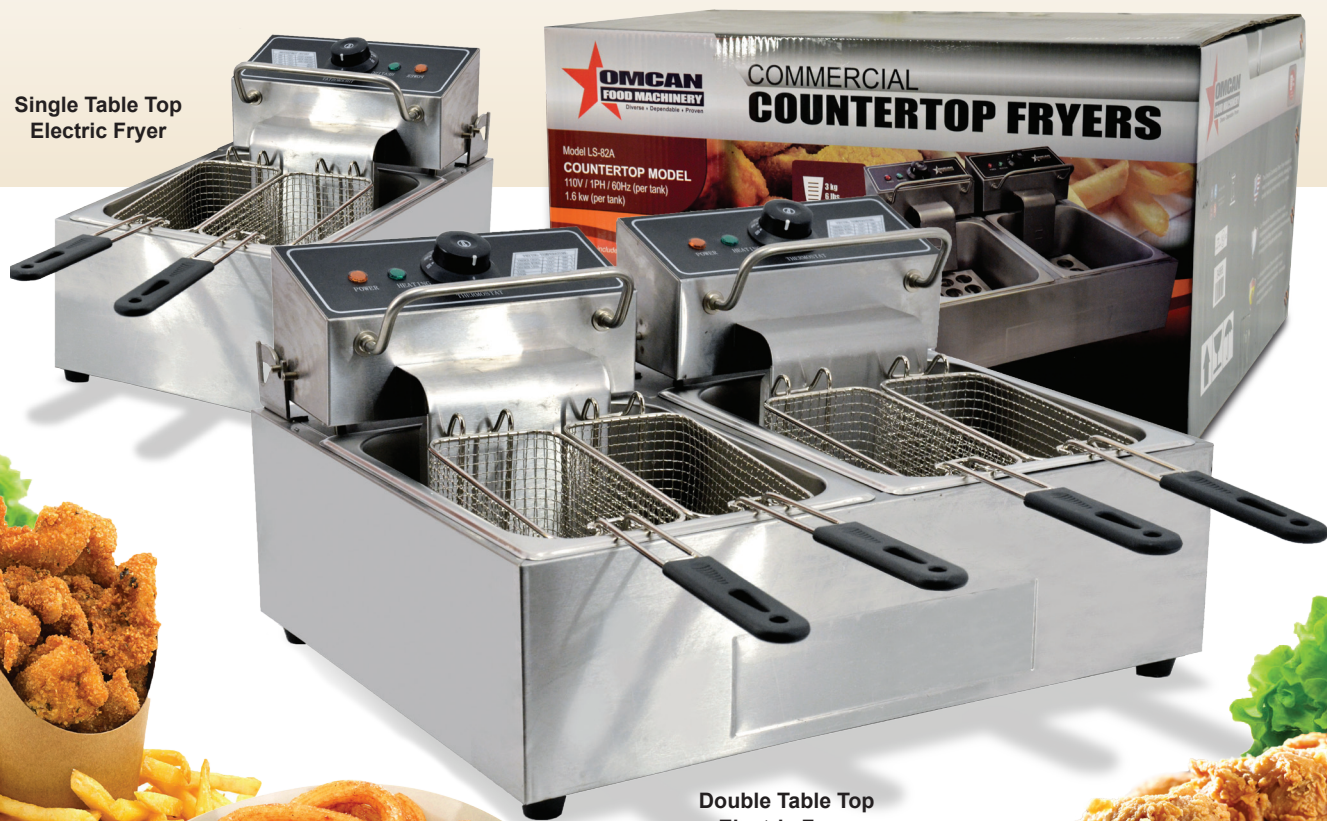
Double Table Top Electric Fryer