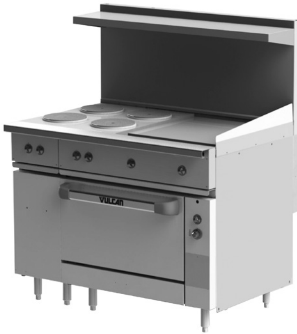
Model EV48S-4FP24G208 shown with adjustable legs