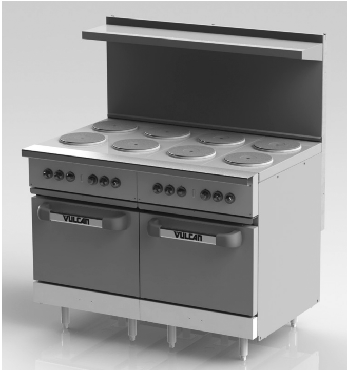
Model EV48-SS-8FP-208 shown with adjustable legs

Modular range shipped in multiple cartons