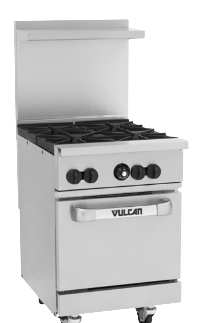
Model 24S-4N (shown with optional casters)