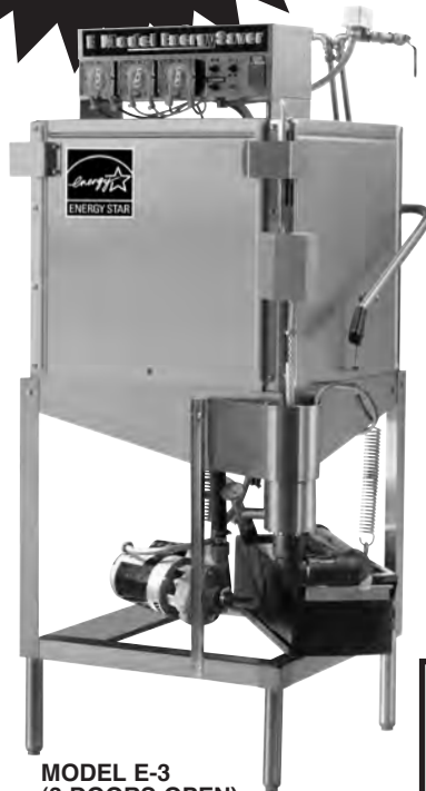
MODEL E-3 (3 DOORS OPEN) AVAILABLE IN STRAIGHT AND CORNER MODEL