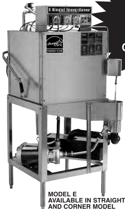
MODEL E AVAILABLE IN STRAIGHT AND CORNER MODEL

USES ONLY .93 Gallons Of Water Per Cycle!