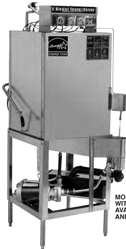
MODEL E EXT WITH 20-1/2" DOOR OPENING AVAILABLE IN STRAIGHT AND CORNER MODEL