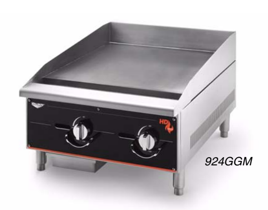
Cavenne® Heavy-Duty Gas Griddle