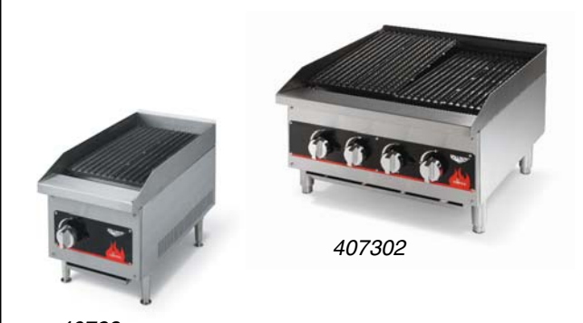
Cayenne® Medium-Duty Charbroilers