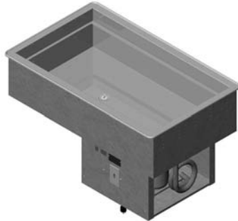
Modular Drop-In: NSF7 Refrigerated Cold Pans