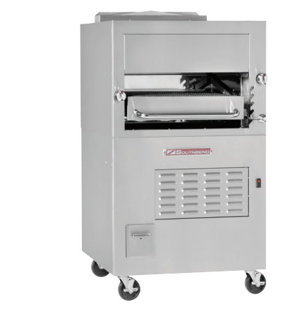
170 (Single Deck)