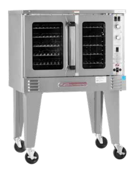
SLES/10SC shown with optional casters