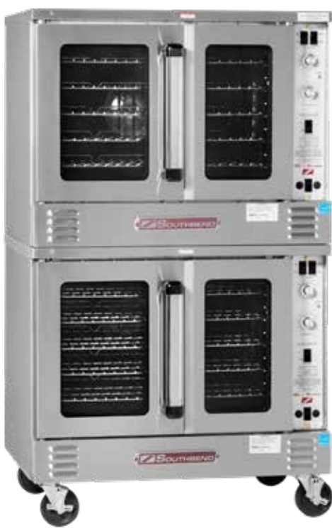
SLES/20SC shown with optional casters