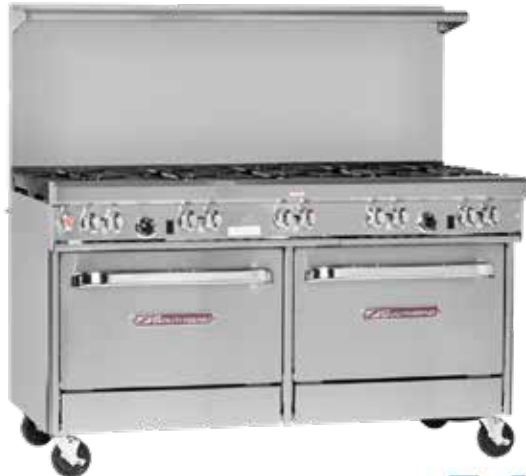
4601DD (shown with optional casters)

Configure your own custom spec sheet and model number at www.BuildMyRange.com . Refer to AutoQuotes for list pricing.