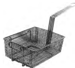
#309781 double-fry basket

* Two covers required for #EF102-240 double-tank fryer.