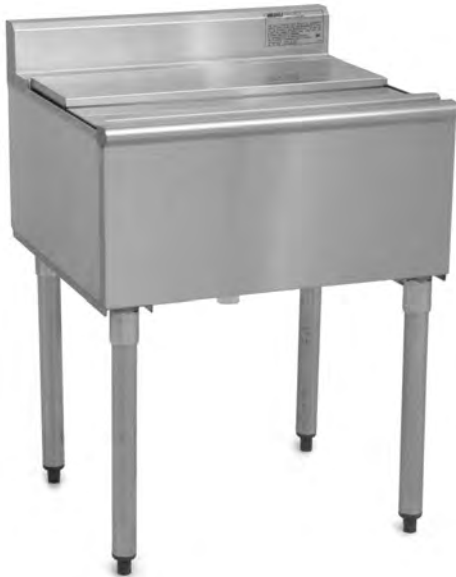
B2IC-22-7 ice chest

Eagle 2200 Series Ice Chests with Sealed-In Cold Plate, model _____. Top, front, backsplash and fabricated ice bin are heavy gauge type 304 stainless steel. Ice bin is fully insulated, with 1½" drain, and sealed-in 7-circuit cold plate. 1½" O.D. galvanized tubular legs with adjustable bullet feet.