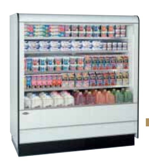
Refrigerated Self-Serve High Profile — RSSM Merchandiser: Attention-getting design encourages impulse sales

Refrigerated Self-Serve High Profile Dairy Merchandiser — RSSD: Get maximum return while increasing impulse sales and profits