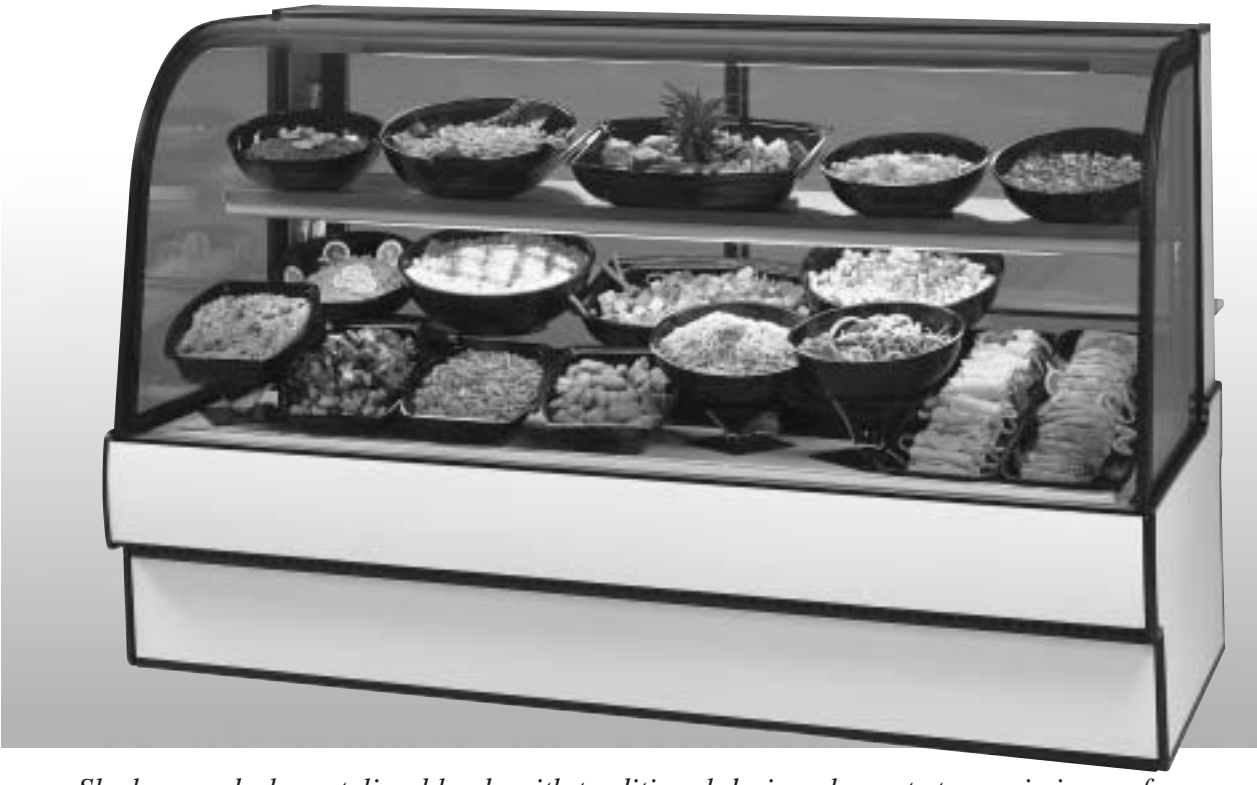
Sleek curved-glass styling blends with traditional design elements to maximize performance. Cases are available in lengths of 50", 59", and 77". Designed for continuous case line-ups without middle end glass.