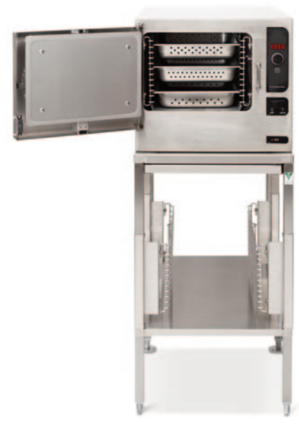
Shown with optional Stand and Cafeteria pans