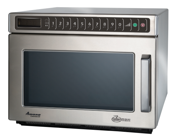
Model HDC212 shown