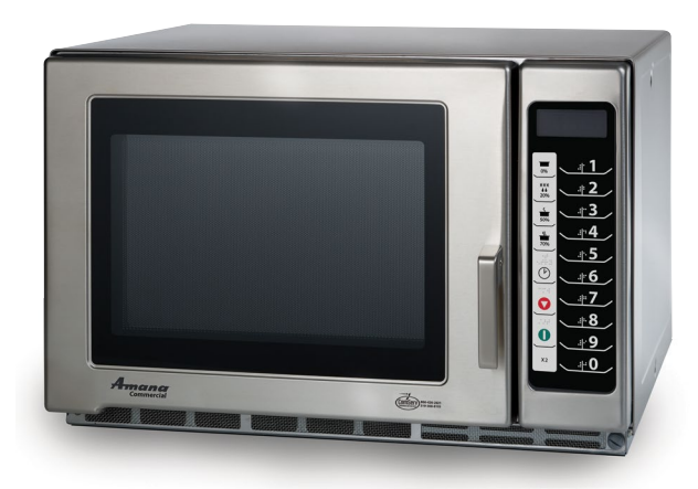
Model RFS12TS shown