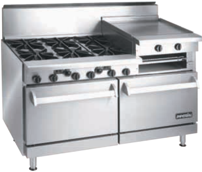
Model IDR6-RG24 Imperial Residential Range 61" (1549) wide, with 6 open burners, 24"(610) griddle/broiler and two 26½" (673) ovens