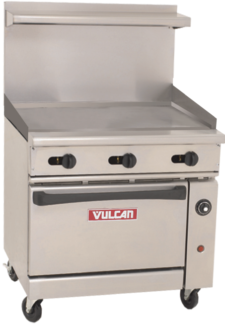
Model 36-S-36G-N (shown with optional casters)