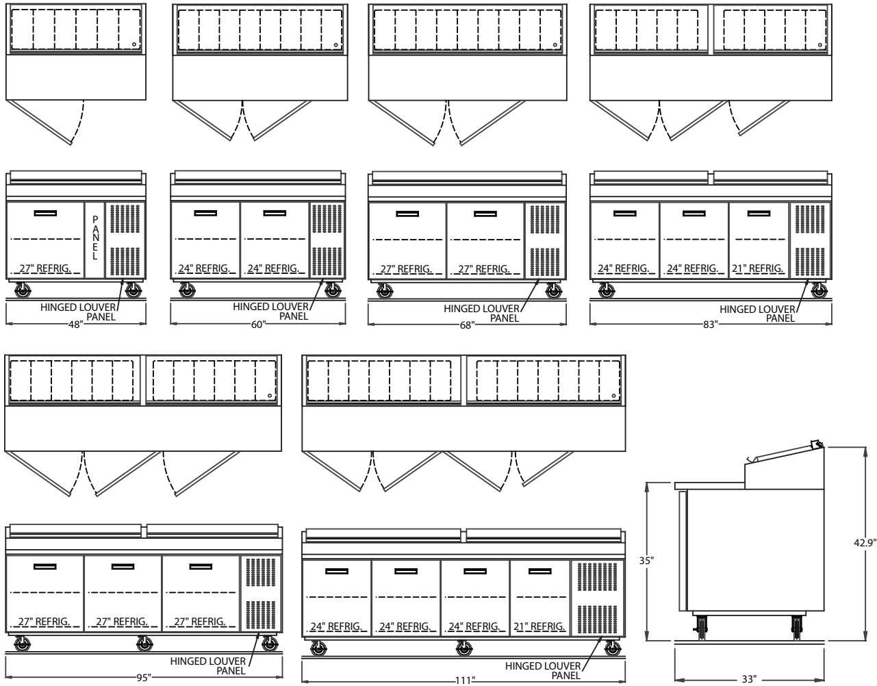
Drawings are to be viewed in the same order as the chart, one drawing to represent refrigerator and freezer units