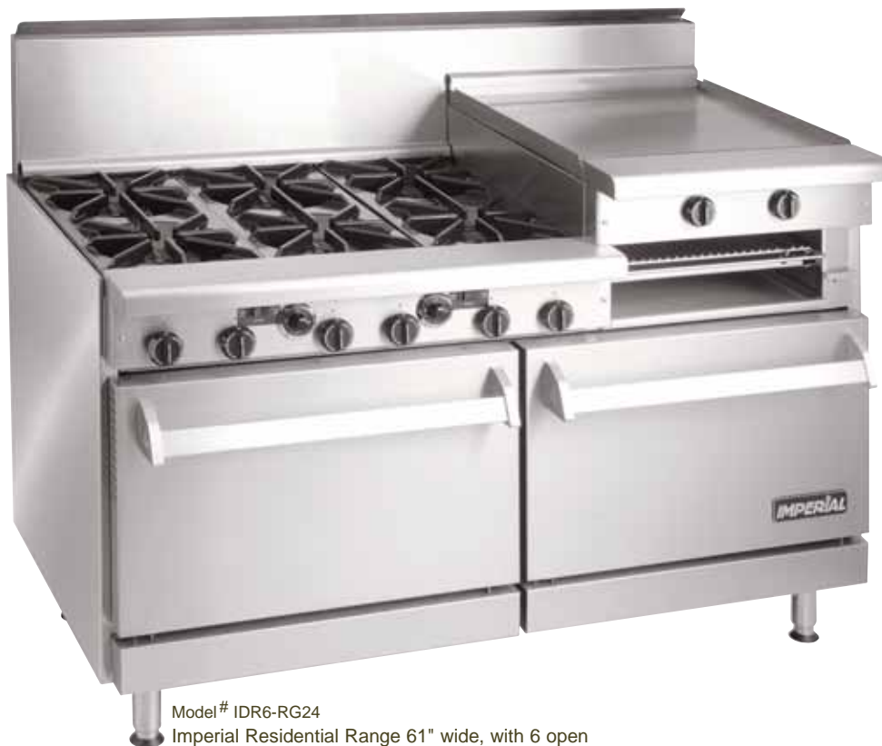
Model# IDR6-RG24 Imperial Residential Range 61" wide, with 6 open burners, 24" griddle/broiler and two 26 1/2" ovens